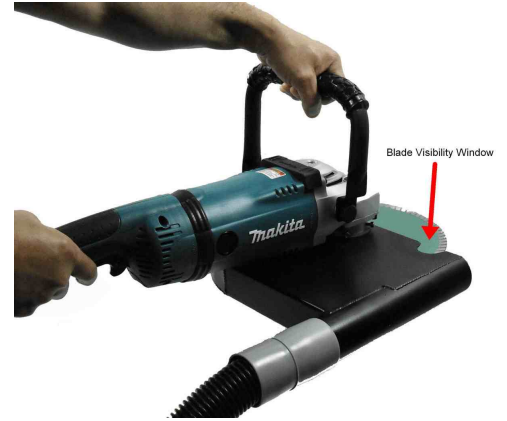
Horizontal Wall Cutting Position Arrow shows Blade Visibility Window