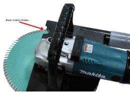
HORIZONTAL WALL CUTTING POSITION Arrow Shows Blade Visibility Window