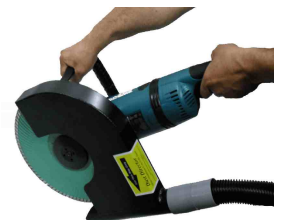
STANDARD CUT-OFF Cutting POSITION

2. CUTTING WITH THE DUST DIRECTOR. Your initial cut into the work surface needs to be on a 45° angle. Ease the Dust Director into the material to be cut on a 45° angle. The shoe of the Dust Director must touch the work surface. Always keep the barrel's shoe within a 1/4" of the work surface. IMPORTANT: Only cut in the direction of the Yellow "Arrow" Sticker on the Dust Director™ or "towards the vacuum barrel" on the Dust Director™. Cutting in the opposite direction will result in unsatisfactory dustless cutting.