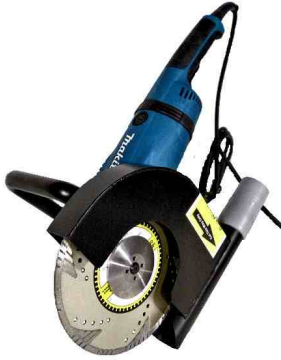
12" Dust Director 12" Blade for 4-1/4" Depth-of-Cut