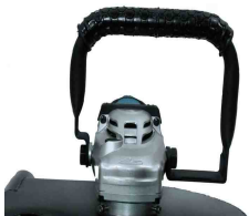
Loop Handle Installation