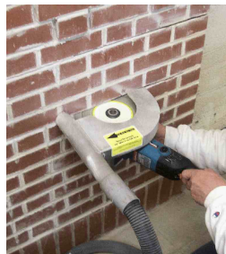
Horizontal Cutting Position