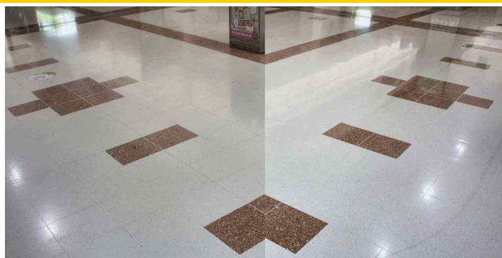
Take your floor from this . . .