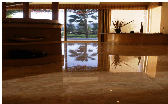
Floor Renovations, Transformations - Maintain the Shine.