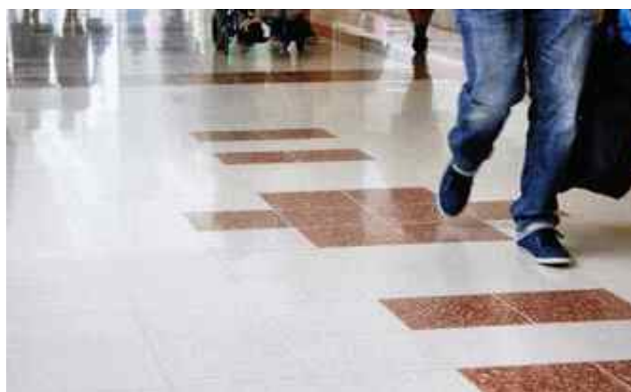
* Only the 1500, 3000 & 8000 DiamaPads are suggested for VCT.